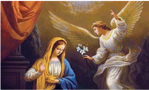
The Solemnity of the Annunciation of the Lord It will be on Monday, April 8 th , 5:30 pm ~ SPP